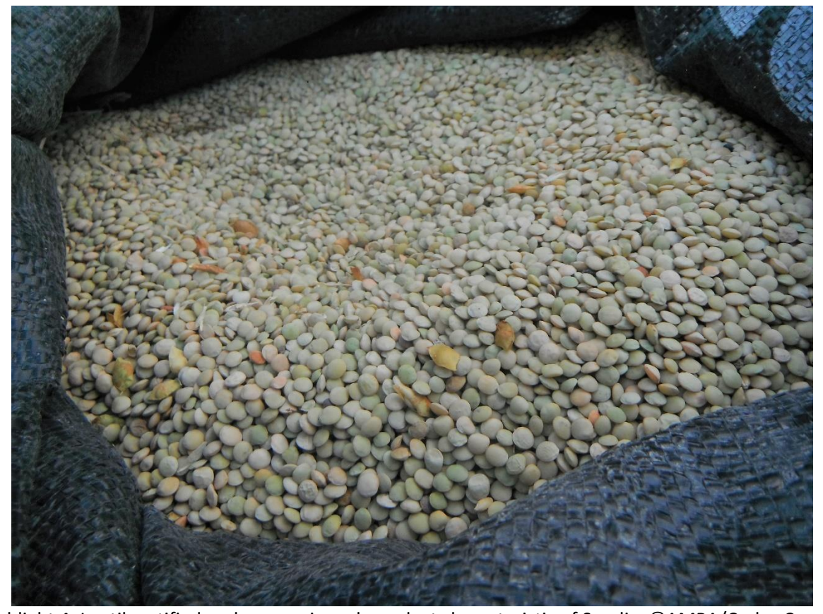
Highlight 4. Lentil certified under organic seal, product characteristic of Sundia.