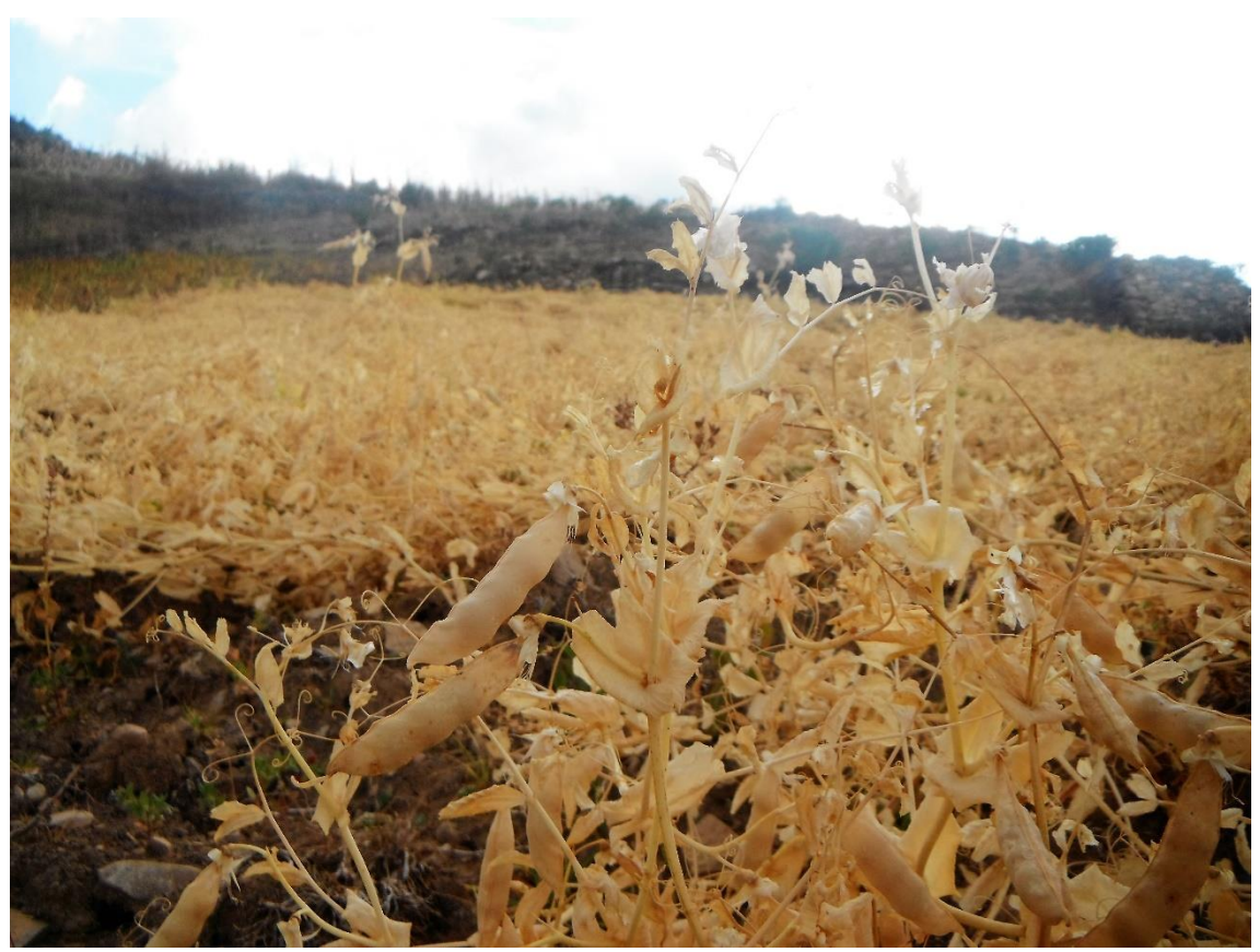
Highlight 4. Growing of pea in Sundia, another product credited under organic seal.