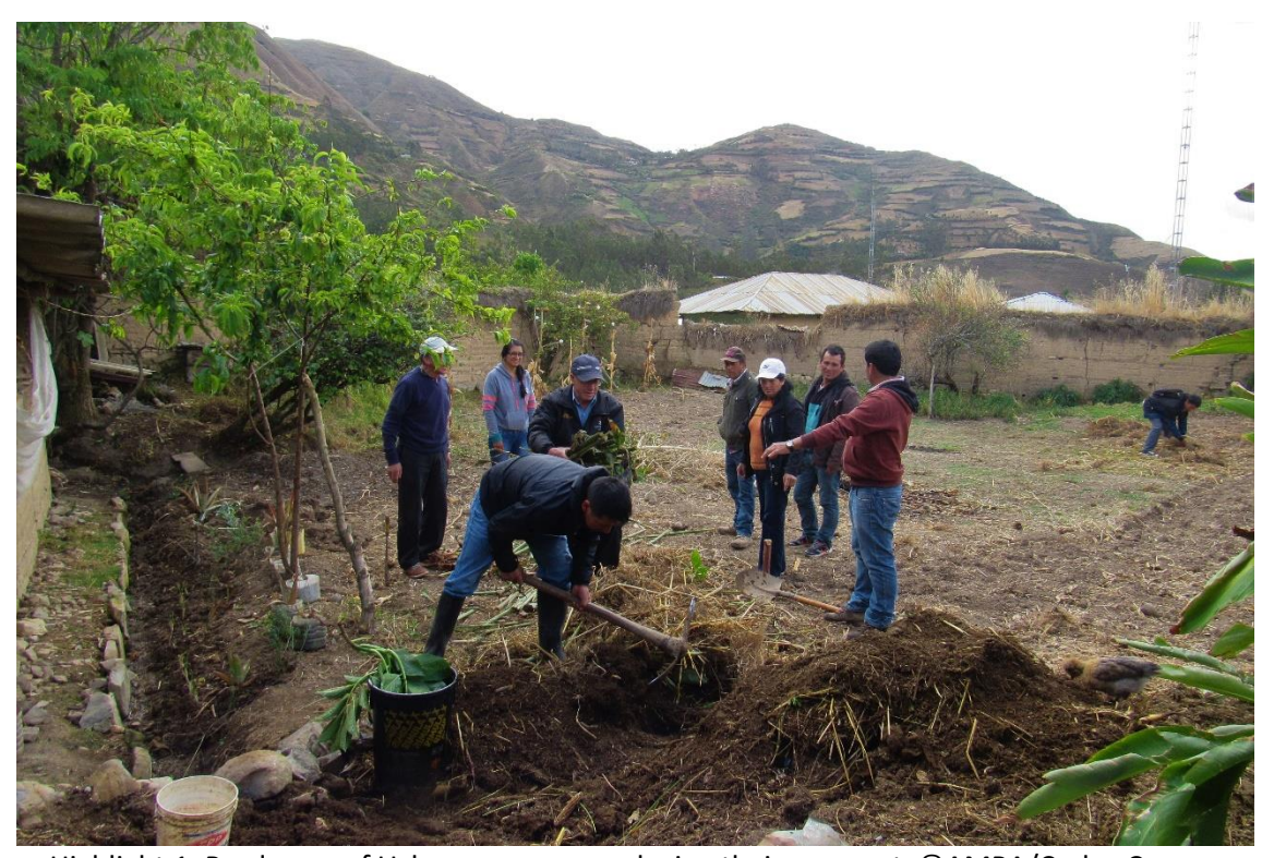
Highlight 1. Producers of Uchumarca are producing their compost.