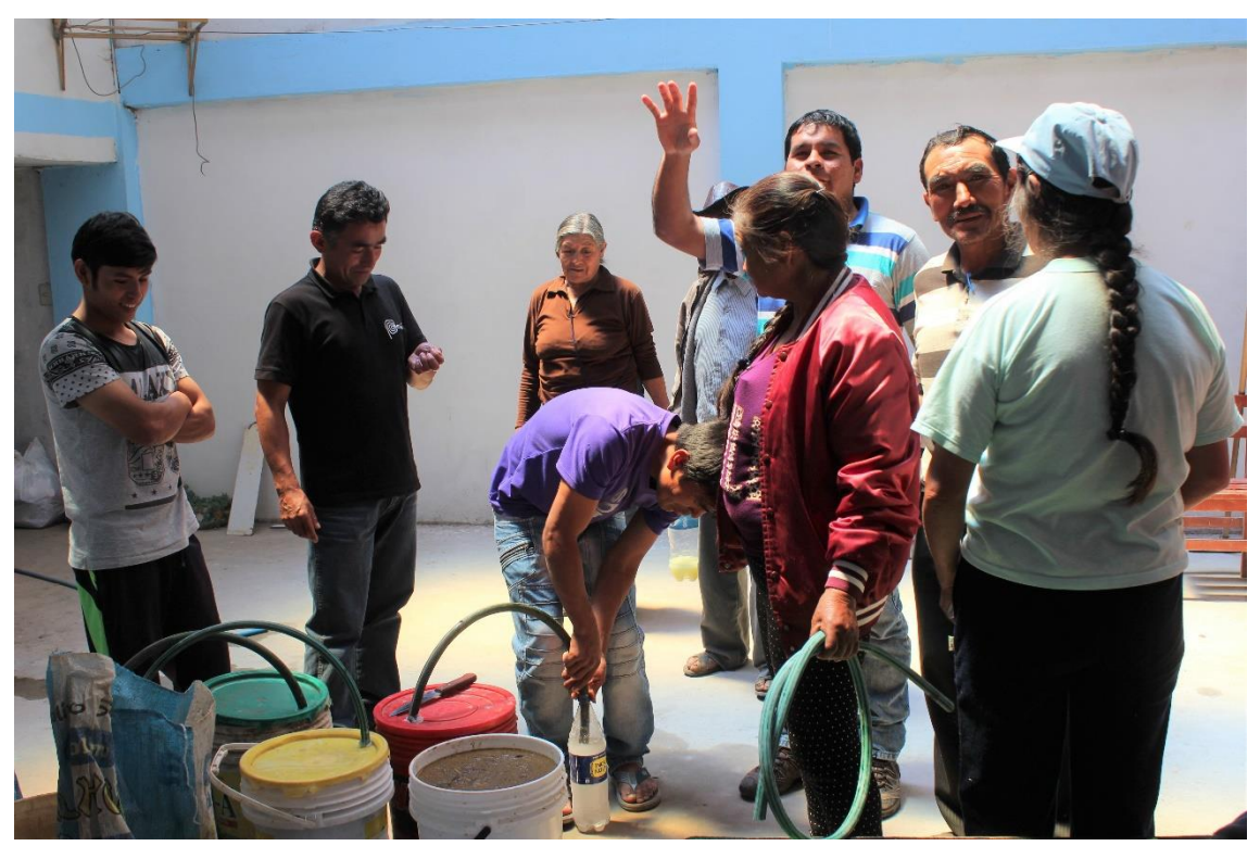
Highlight 1. Producers of Ucuncha are producing their biol .