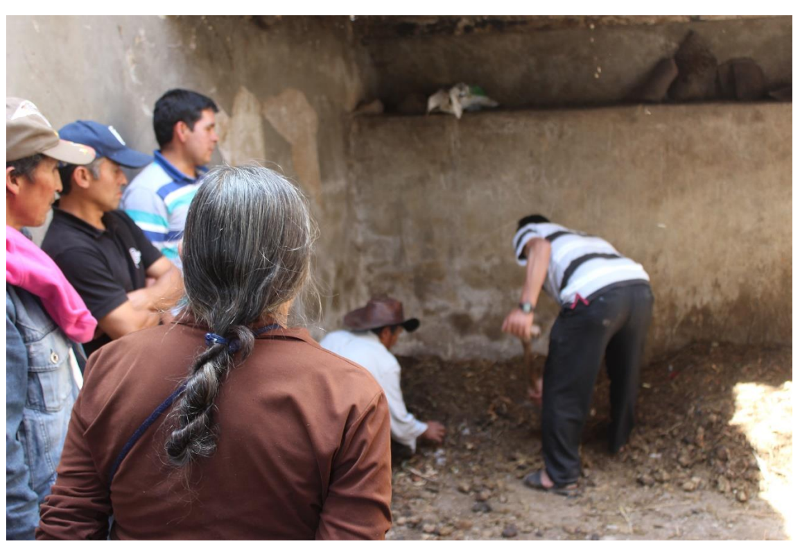
Highlight 1. Producers of Ucuncha are producing their compost.