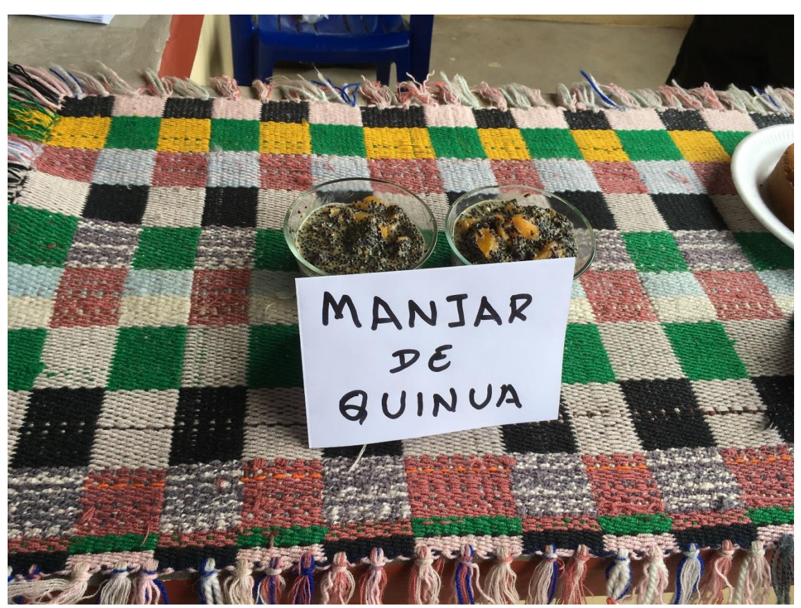
Highlight 2. "Manjar de quinoa", dessert winner in the category of Sweets and Desserts. ©AMPA/Marco Gutiérrez.