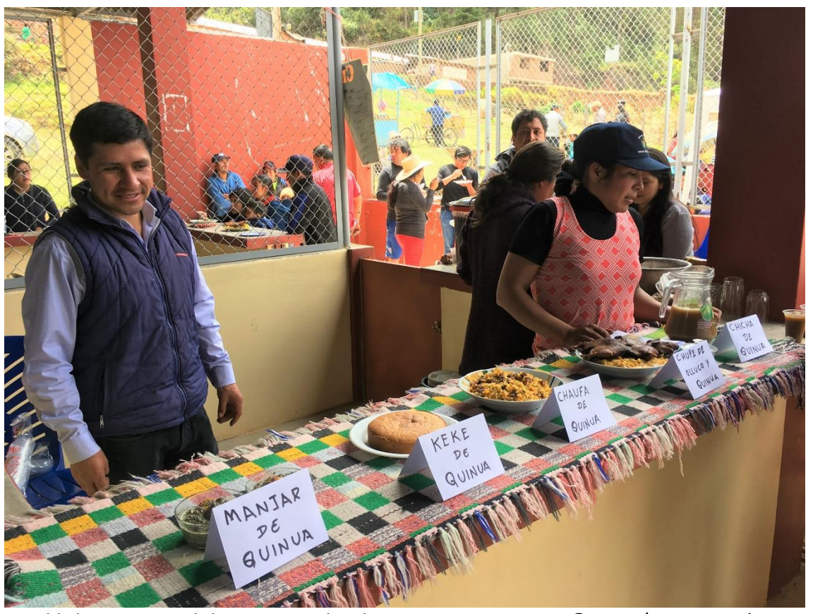
Highlight 2. Various dishes presented in the gastronomic contest.