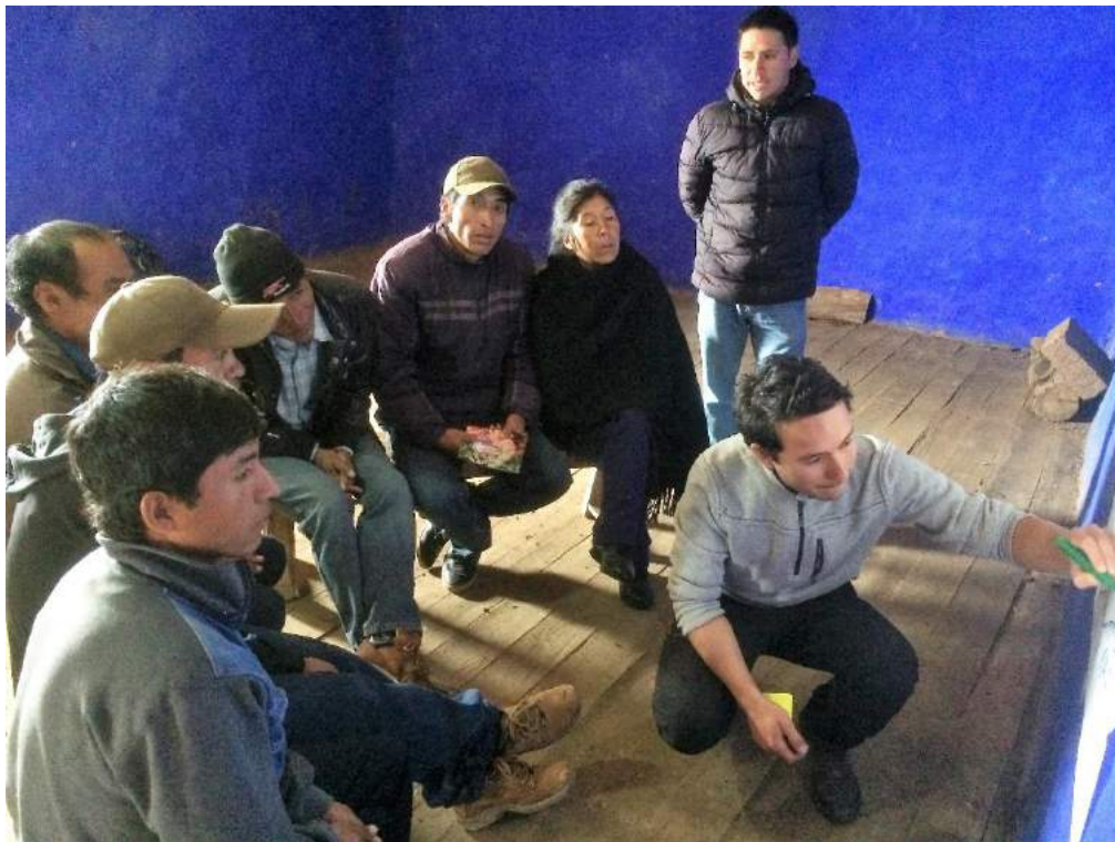
Highlight 1. Members of the Peasant Community of Bambamarca, discussing and establishing their area of influence, as part of the participatory mapping exercise.