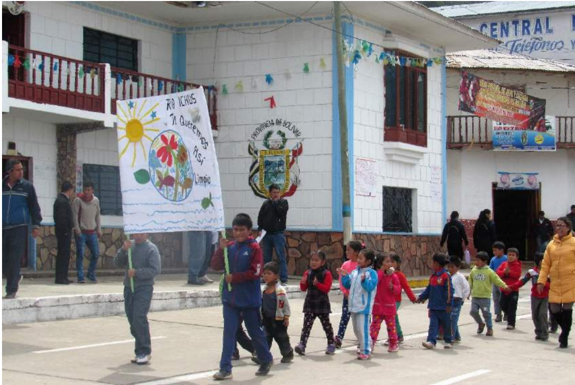
Highlight 3. Children of the elementary school of the district of Bolivar marching through the main square, request to the population to keep their creek clean.