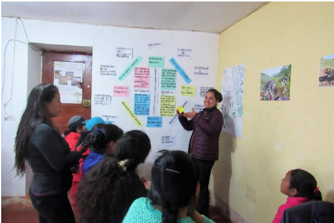
Highlight 1. Group of women from Uchumarca, Uchuncha and Bolívar, discussing the indicators of resilience.