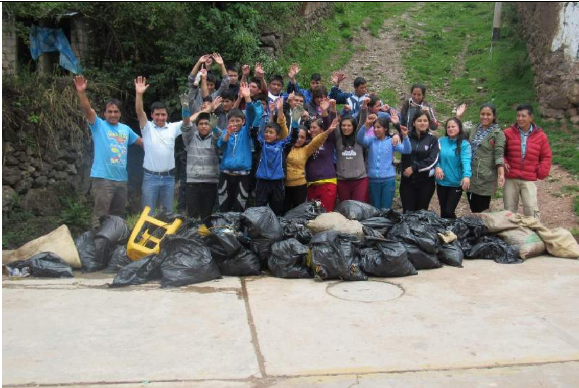
Highlight 3. Garbage collectors in the Ichus creek.