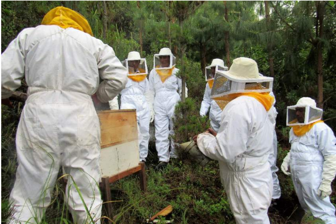
Highlight 5. Field practice on management of apiaries.