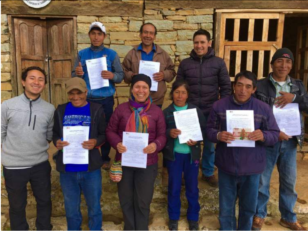
Highlight 2. Signing of conservation agreements with members of the Peasant Community of Bambamarca, involved in the beekeeping activity.