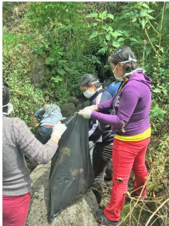
Highlight 3. High school students picking up trash in the Ichus creek.