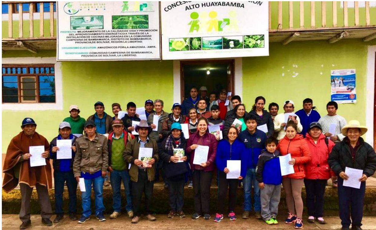
Highlight 2. Signing of conservation agreements with organic and apicultural producers.