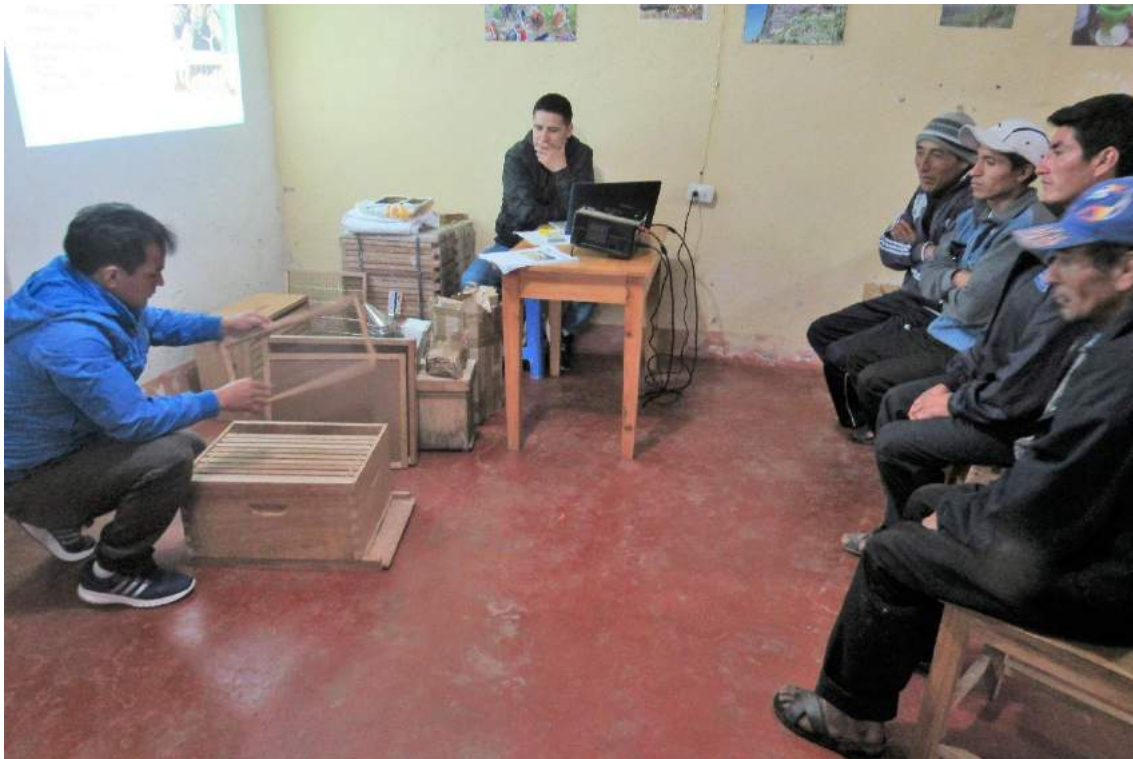
Highlight 5. Explanation about the management of apiaries.