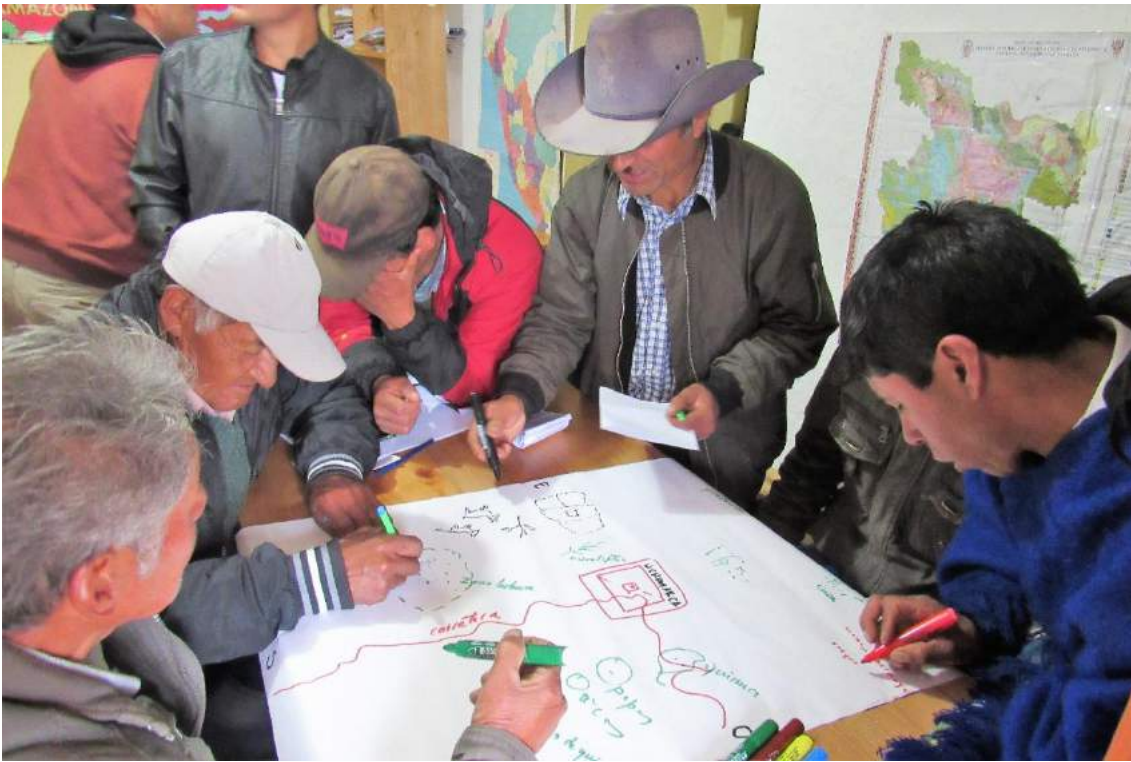
Highlight 1. Group of men from Uchumarca discussing, identifying and drawing their sustainable landscape, as part of the participatory mapping exercise.