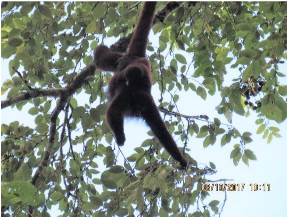
Highlight 6. Mother and baby of yellow-tailed woolly monkey .