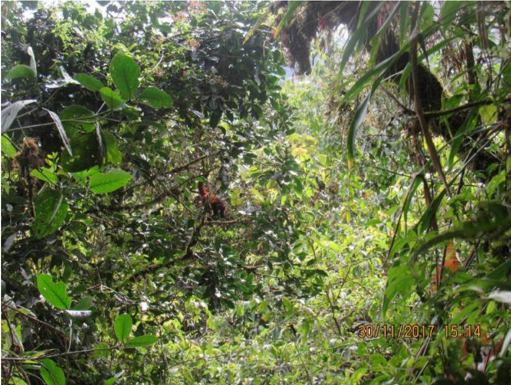
Highlight 6. Yellow-tailed woolly monkey in the montane forests of the Alto Huayabamba Conservation Concession.