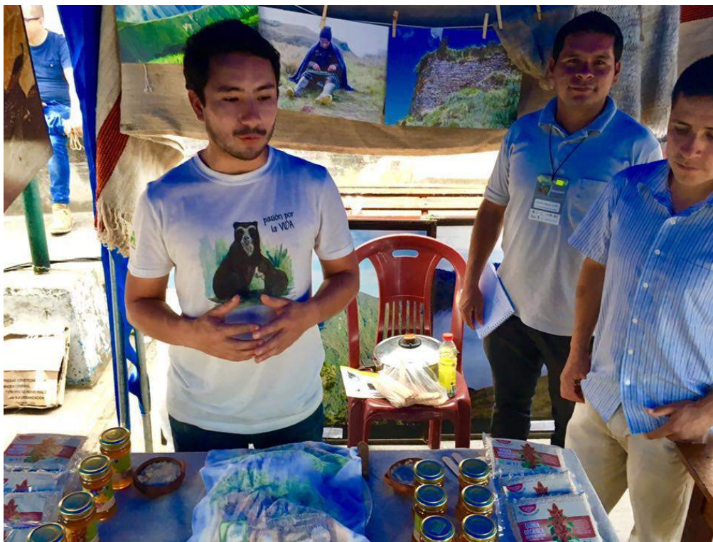
Highlight 4. AHCC's technical team presenting the products of the concession and its buffer zone.