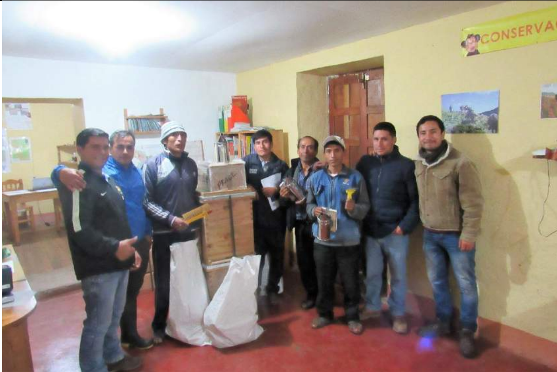
Highlight 5. Members of the Peasant of Bambamarca and its new apicultural modules.