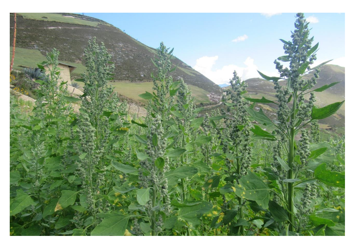
Highlight 1. Quinoa crop in Sundia.