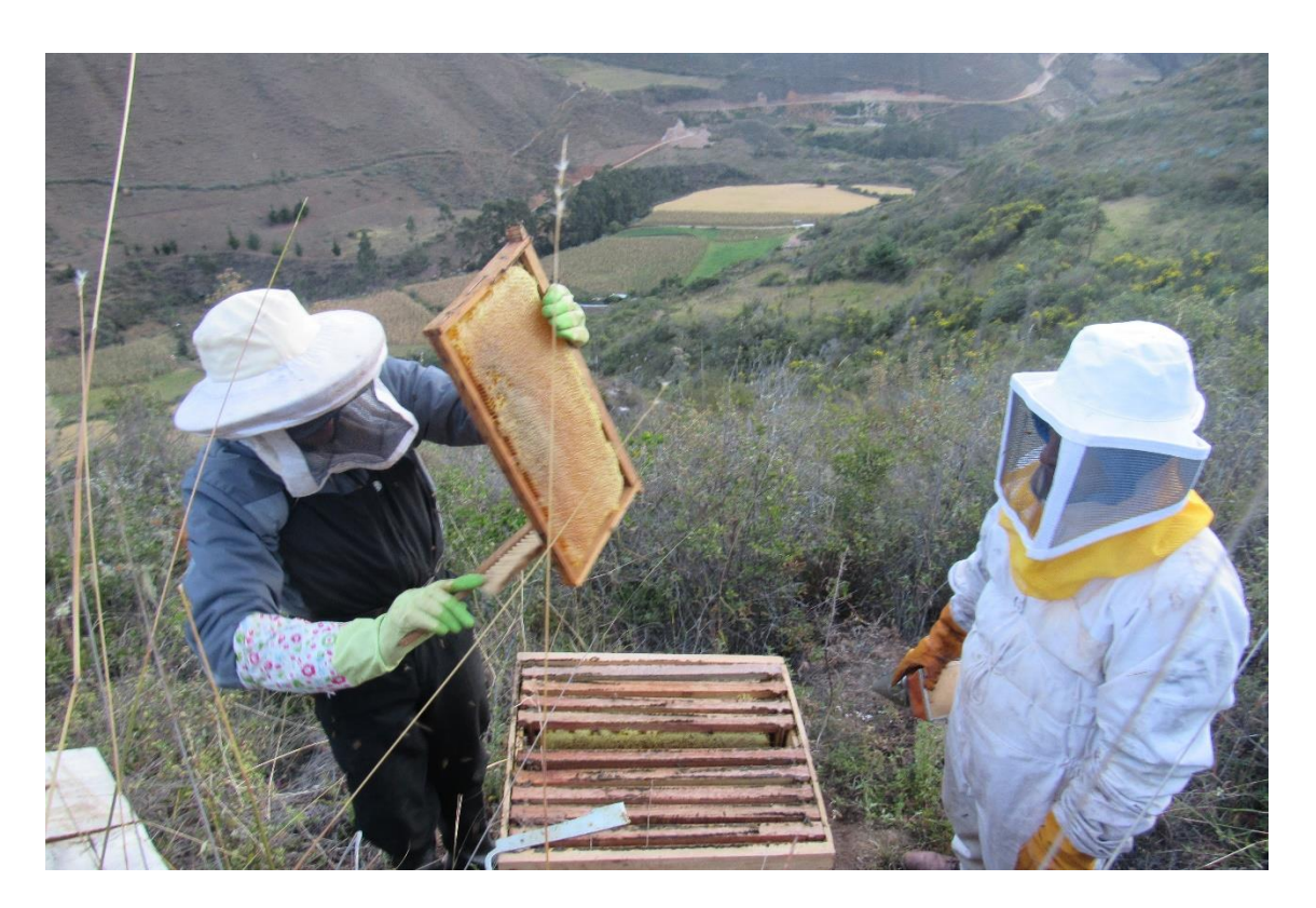
Highlight 1. Extraction of wax frames with honey.