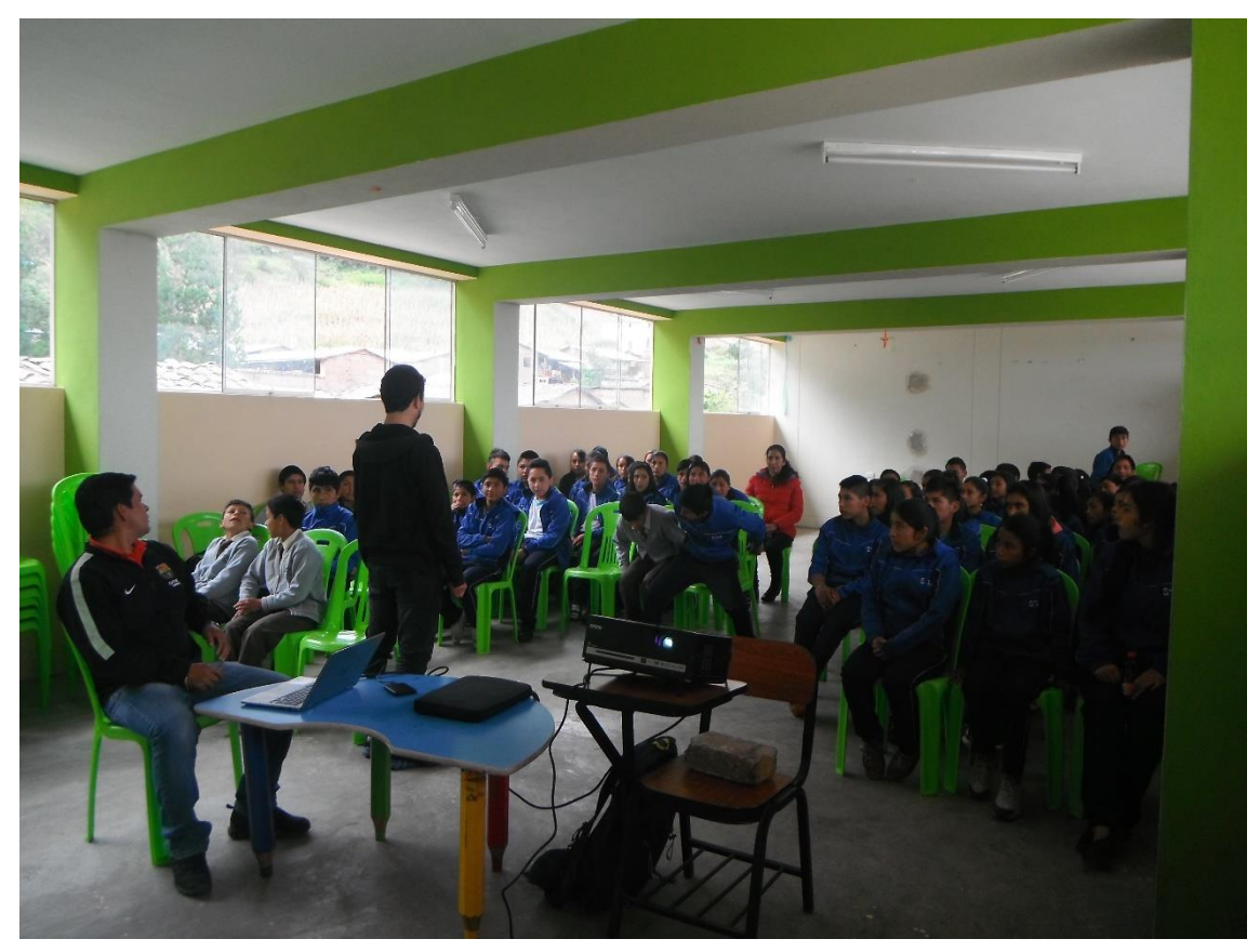
Highlight 3. Talk about the importance of andean crops with school students in Bolivar.