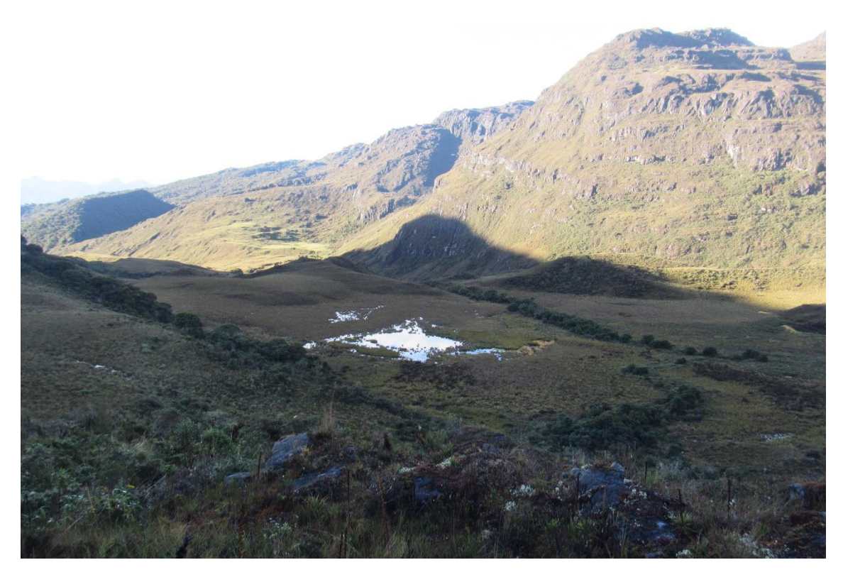
Highlight 2. Transition zone between moors and montane forest, Alto Huayabamba Conservation Concession.