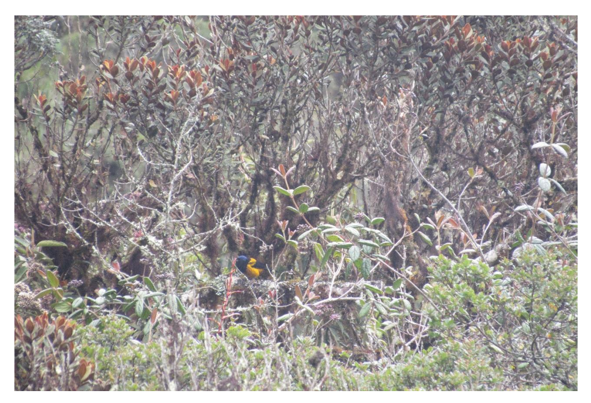
Highlight 2. Golden-backed Mountain-tanager ( Cnemathraupis aureodorsalis ), Alto Huayabamba Conservation Concession.