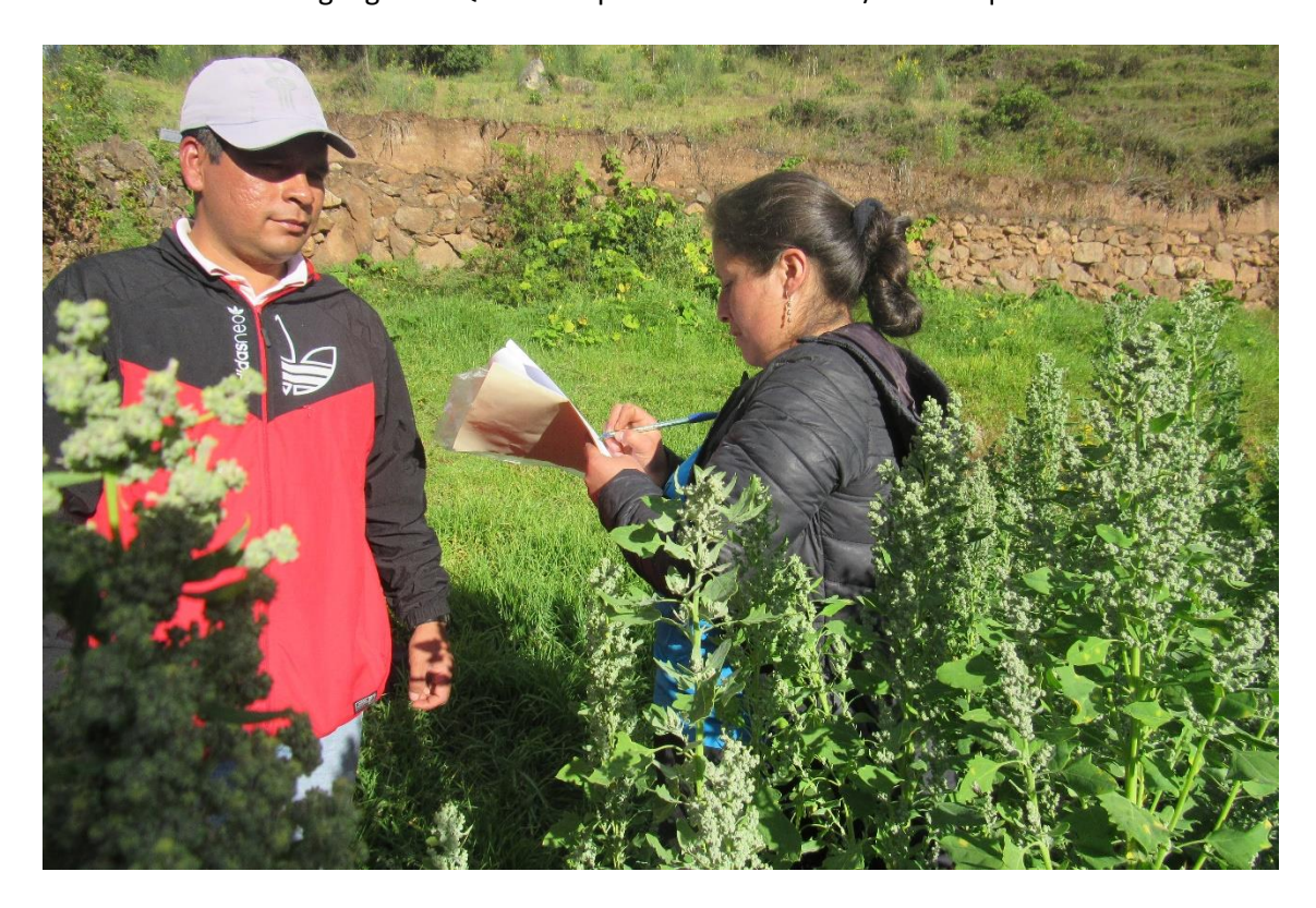
Highlight 1. C Field inspection of a productive area in Bolivar.