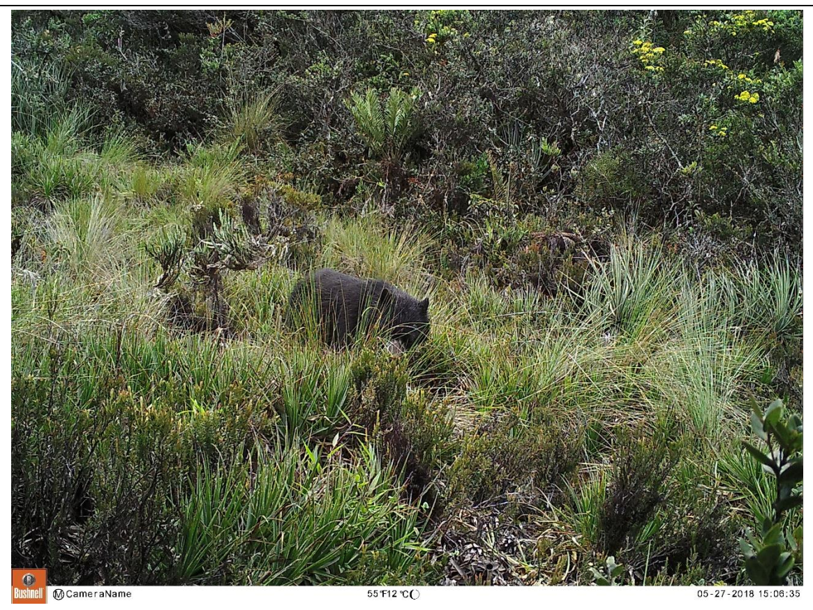
Highlight 4. Spectacled bear ( Tremarctos ornatus ) in search of food, Alto Huayabamba Conservation Concession.