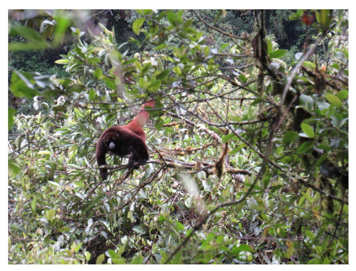
Highlight 4. Yellow-tailed woolly monkey ( Oreonax flavicauda ) close to a monitoring trail, Alto Huayabamba Conservation Concession.