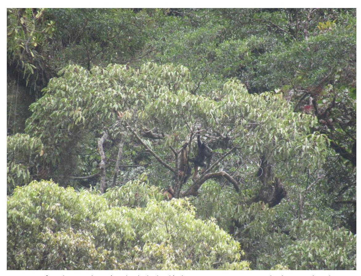
Highlight 4. Group of spider monkeys ( Ateles belzebuth ) close to a monitoring trail, Alto Huaybamba Conservation Concession.