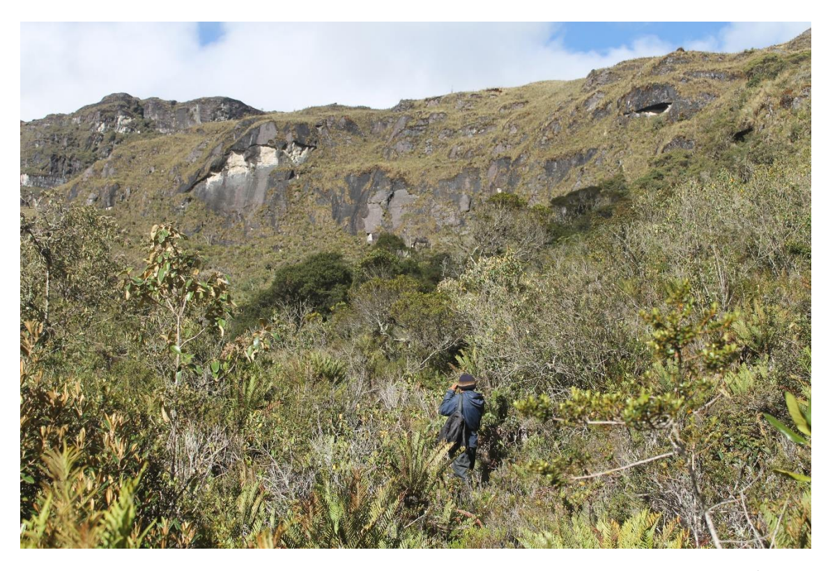
Highlight 2. Bird watching in transition forest, Alto Huayabamba Conservation Concession.