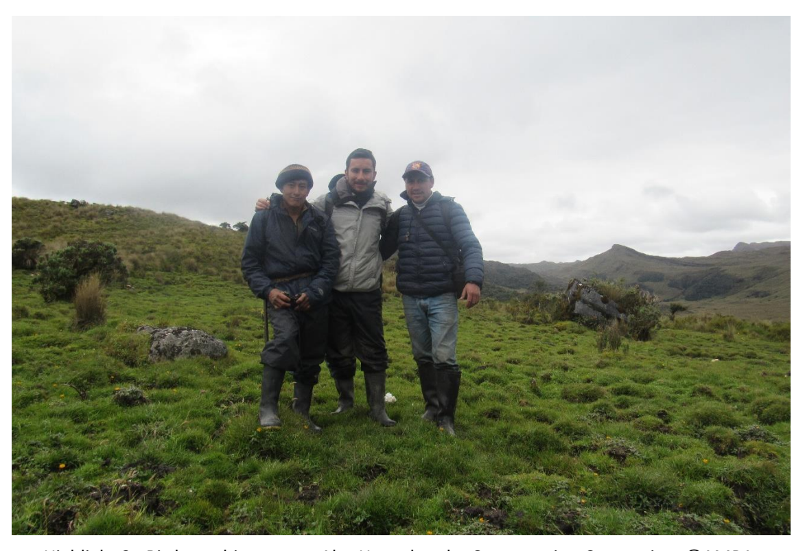
Highlight 2. Bird watching group, Alto Huayabamba Conservation Concession.