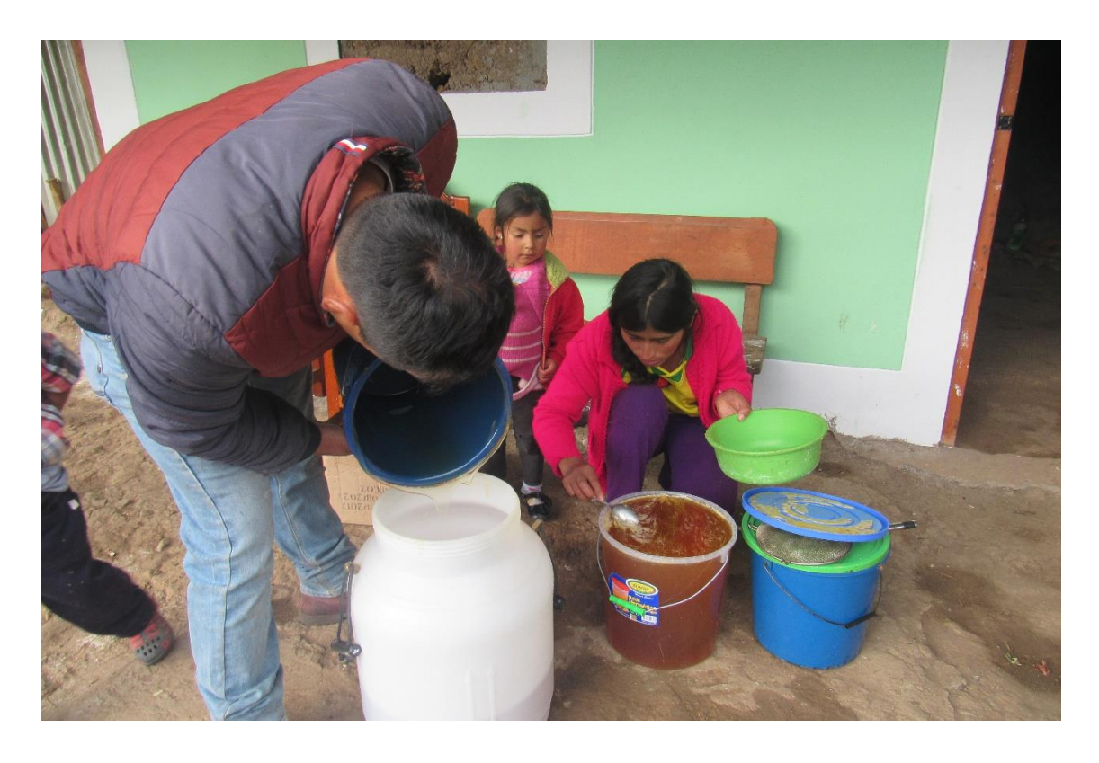
Highlight 1. Storage of honey produced in Bolivar.