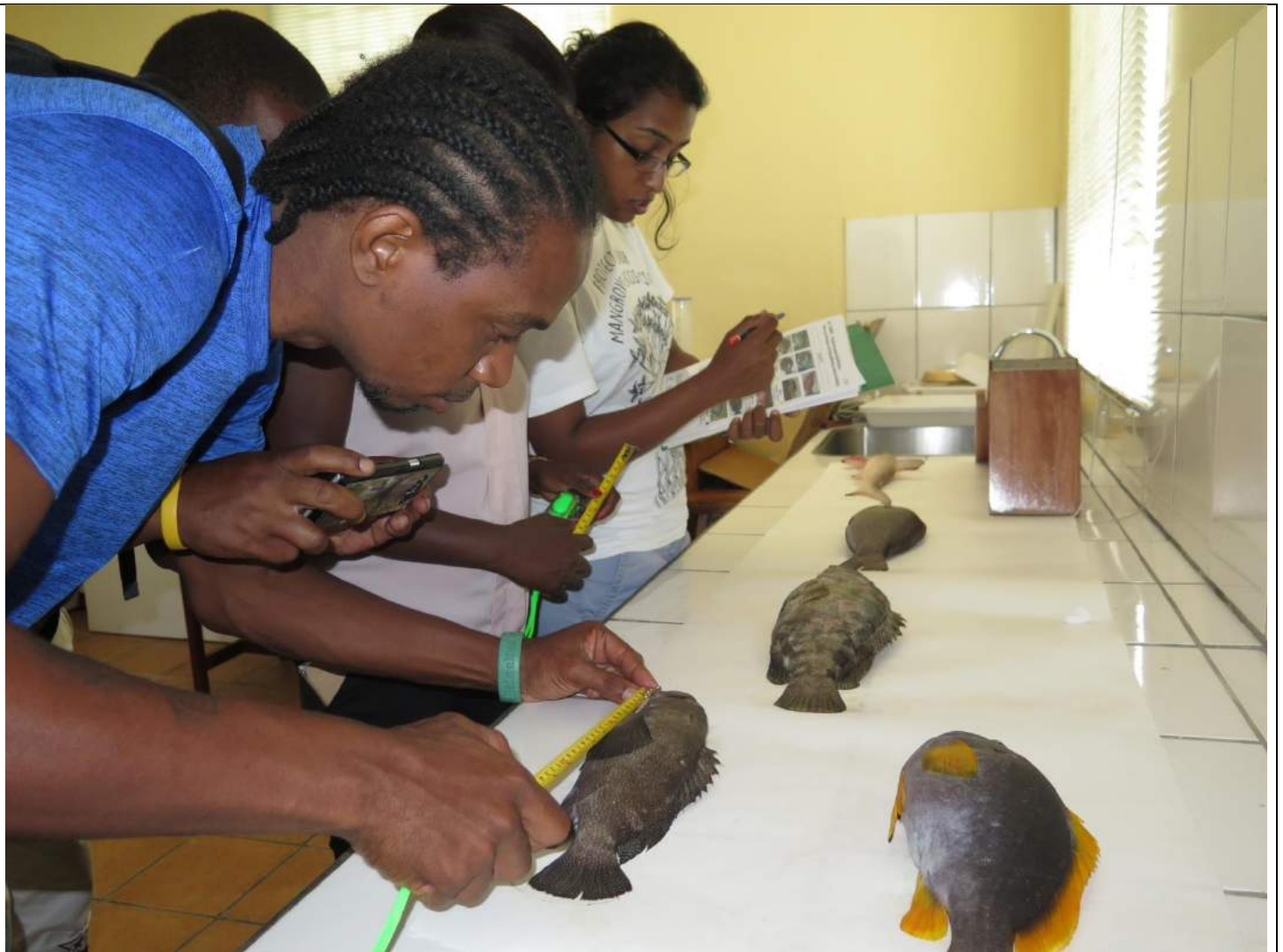
Photo 1c: Participants from local NGOs and project partners practicing in the lab during the “Threatened species identification, field survey technique and data gathering protocol” workshop.