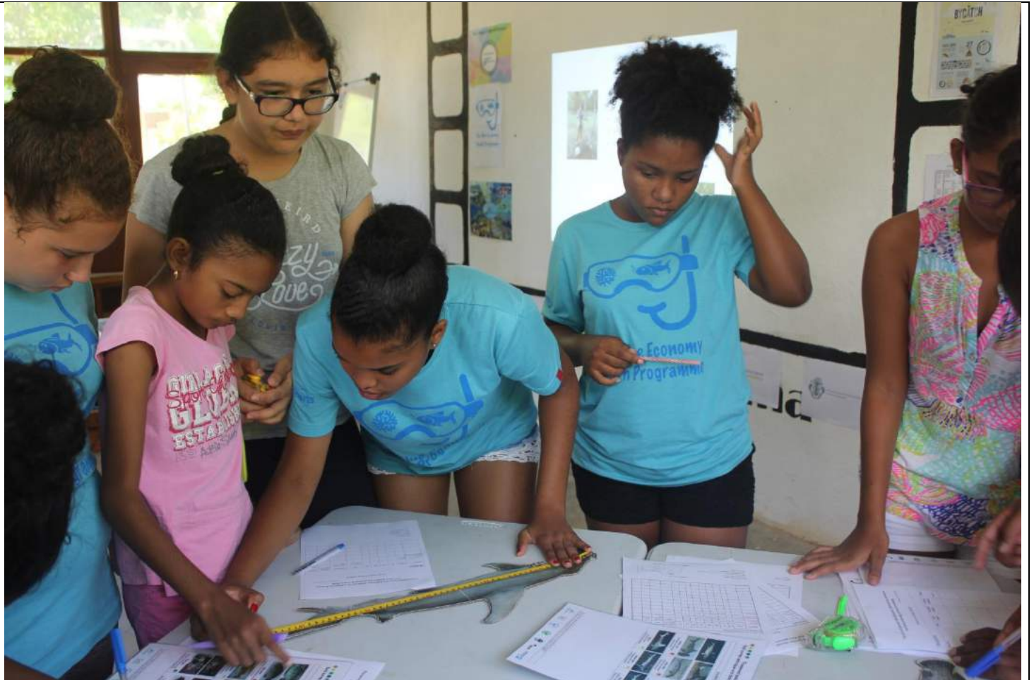
Photo 2c: Students from S1-S4 practicing their skill in threatened species identification, field survey technique and data gathering during the Blue Economy Youth Programme.