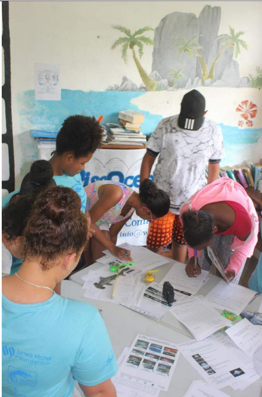
Photo 2d: Students from S1-S4 practicing their skill in threatened species identification, field survey technique and data gathering during the Blue Economy Youth Programme.