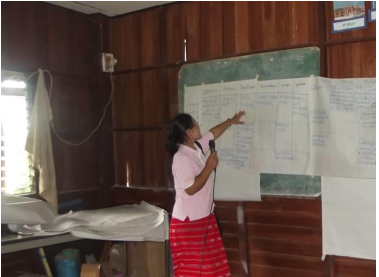
Women leader have done the report at Mae Um Pai community