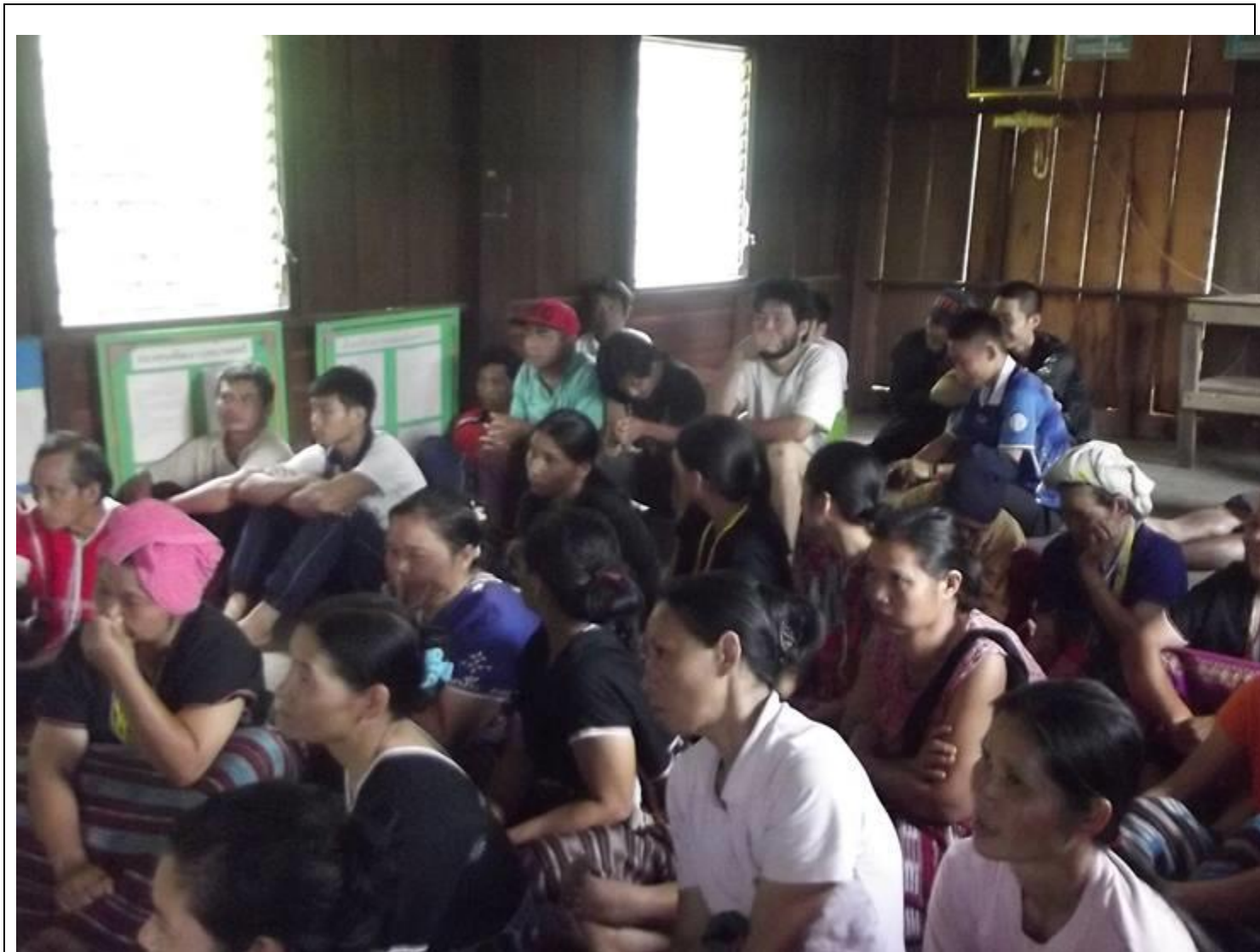
The leaders include women, men and youth in the meeting in Mae Um Pai