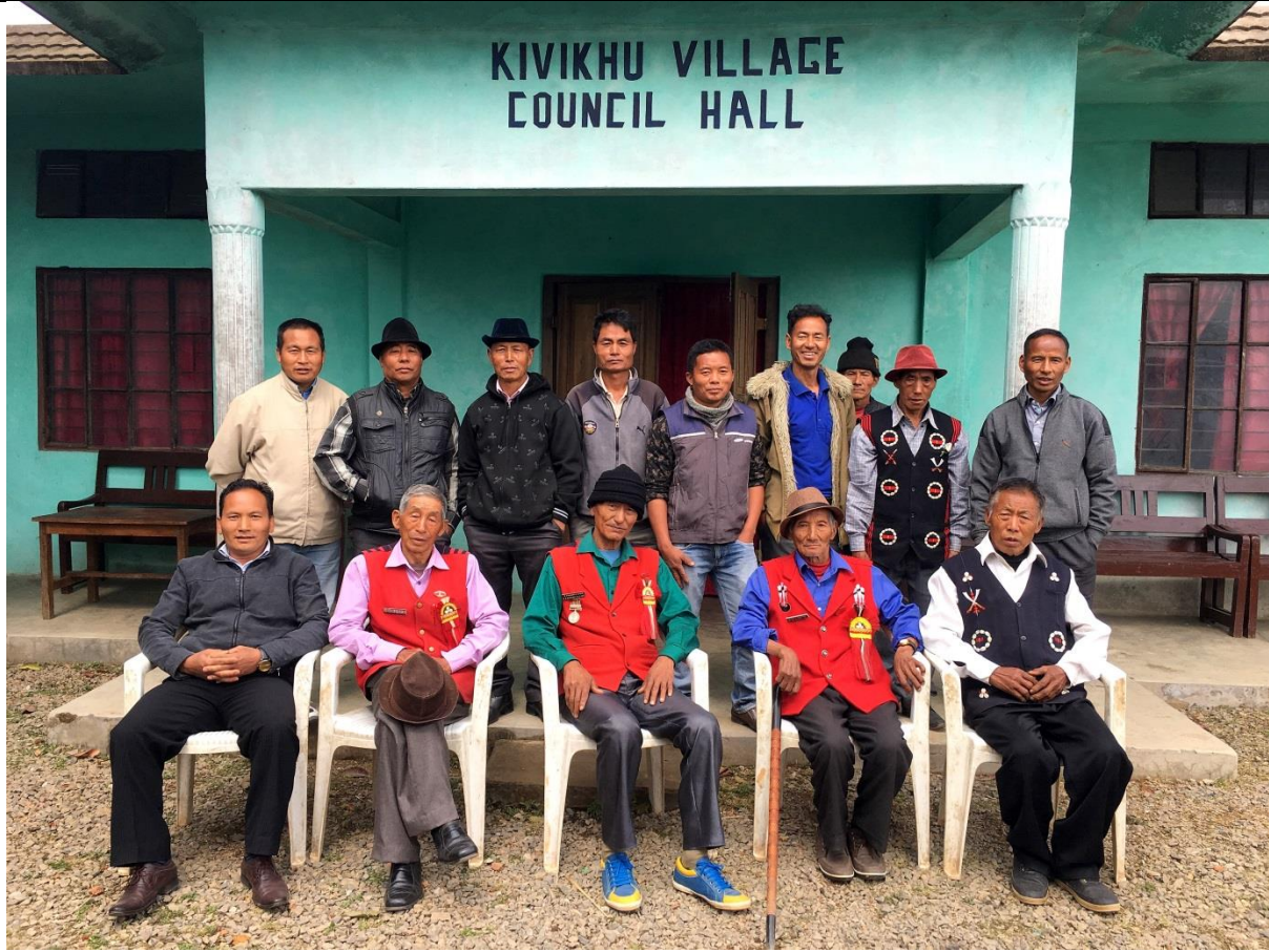
The village council of Kivikhu village poses for a pic