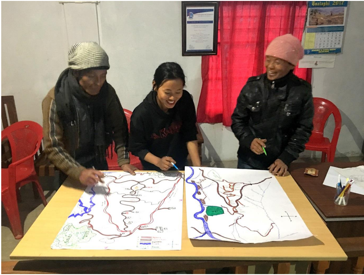
Drawing a village resource map