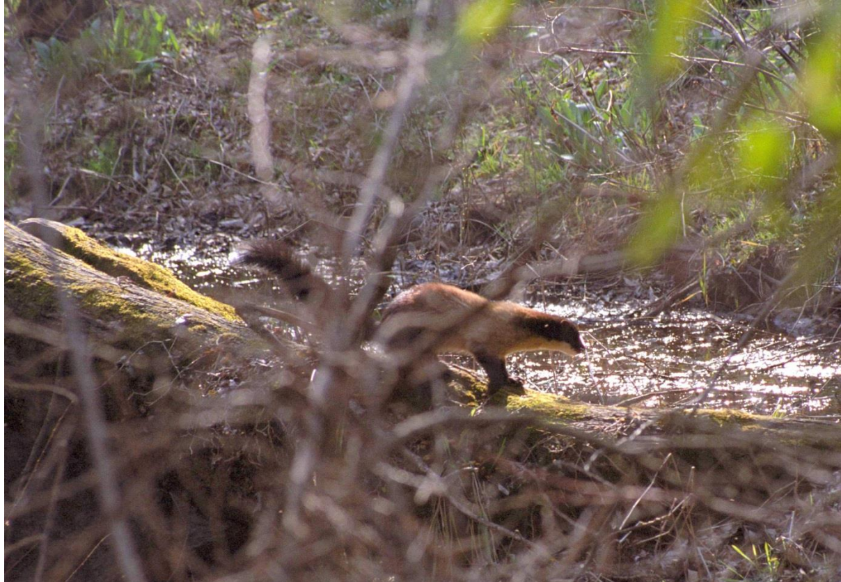
A Yellow-throated Marten