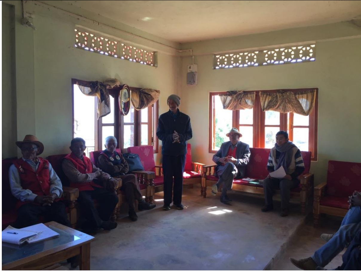
A meeting in which the village councils decide to form a joint CCA