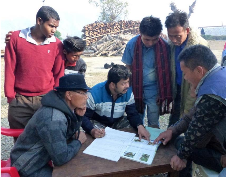
Identification of local fauna through focus group discussions