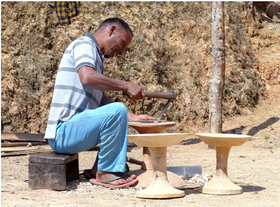
A local artisan fashions a plate for food