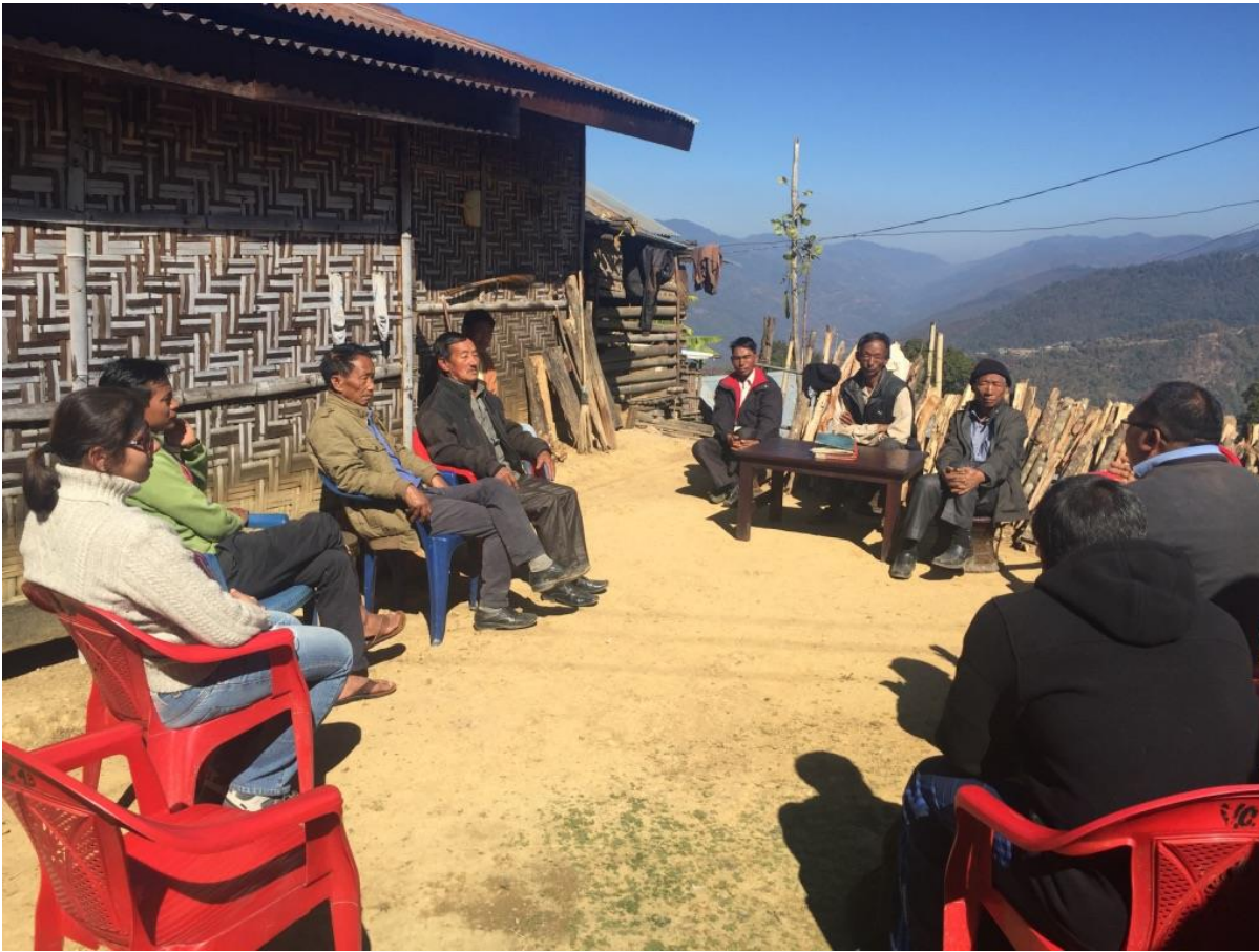
Meeting with the village people of Satoi area (Okhavi village) to discuss how they can cooperate in protecting the Tizu river and regulating fishing