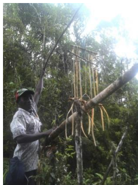
Destruction of a lemur trap during a patrol mission, Makira Natural Park.