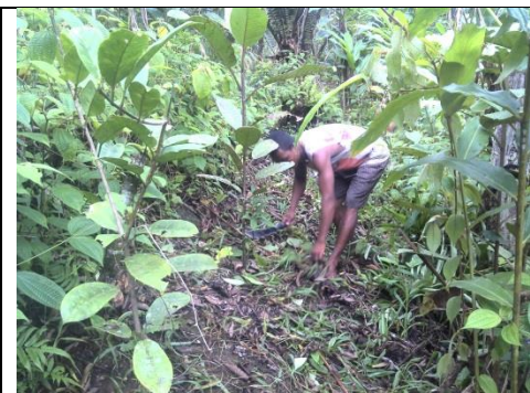
Maintenance in Vohitaly forest corridor, Makira Natural Park.