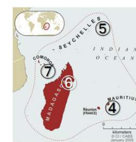
Madagascar & the Indian Ocean Islands